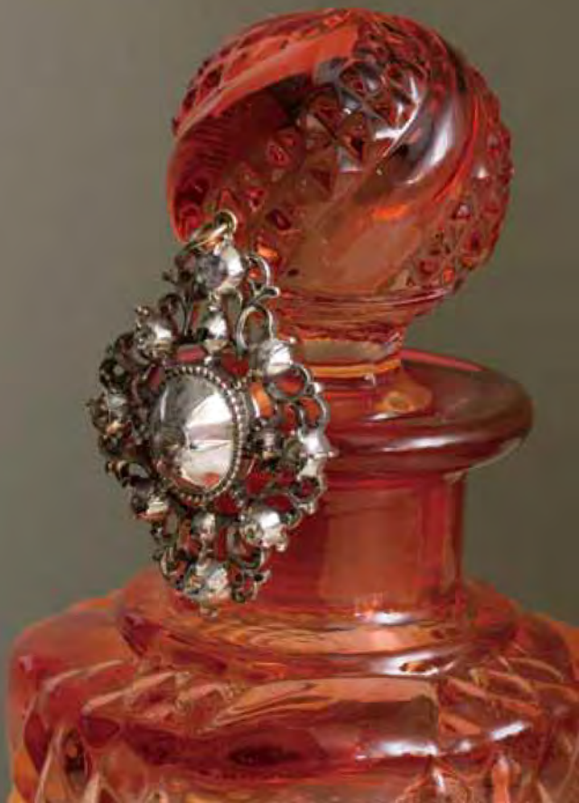
Antique Bacarrat rose perfume bottle Silver and 18ct gold rosecut diamond necklace 1850-80s