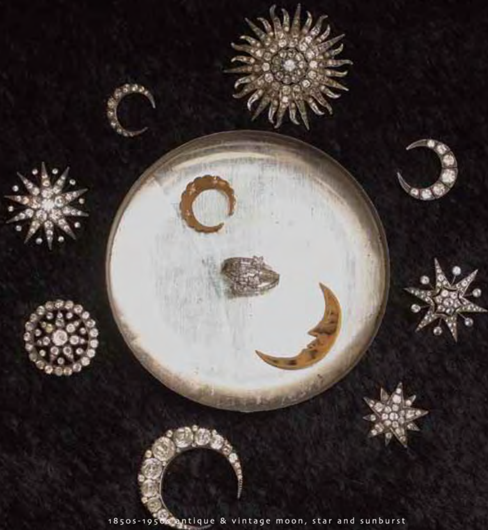
1850s-1950s antique & vintage moon, star and sunburst