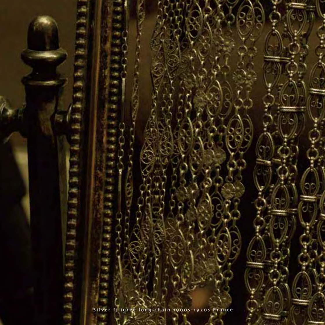
Silver filigrée long chain 1900s-1920s France