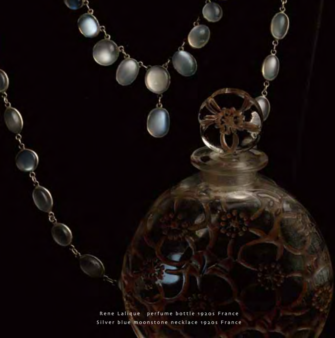
Rene Lalique perfume bottle 1920s France Silver blue moonstone necklace 1920s France