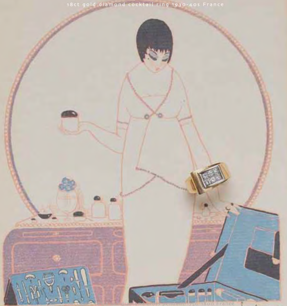
18ct gold diamond cocktail ring 1930-40s France